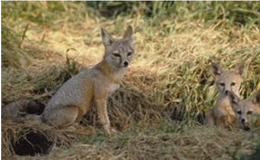
Endangered San Joaquin kit fox family